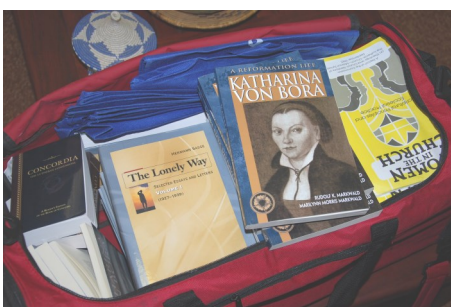
Books brought by Deaconess Rao courtesy of LCMS WR&HC (St.Louis)