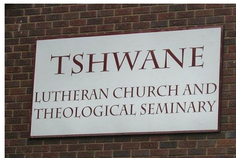
LTS is located in Tshwane (Pretoria), Gauteng Province, South Africa