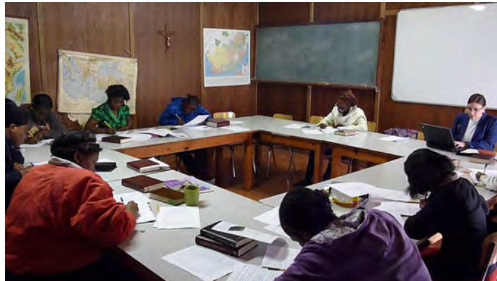
Deaconess students taking their final exam for the semester for the course on Worship

It's a long way that the more than 20 new students have come, since their arrival in February. Now in the early mornings temperatures are already dropping close to zero degrees centigrade even if at noon they still climb to comfortable levels of around 25°. The sun is shining ever so brightly leaving the skies in deepest blue contrasting lovely with the remaining leaves on many trees in Pretoria. Learning the ways of the Seminary always takes some time, but I get the impression most of the new students have slotted into the workings at LTS pretty nicely after these first four months: listening, learning, debating, writing,