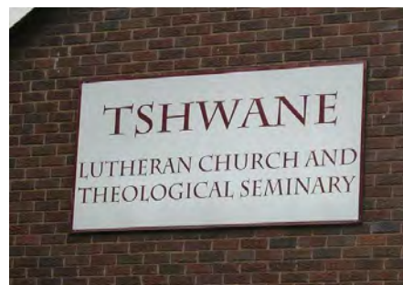
LTS is located in Tshwane (Pretoria), Gauteng Province, South Africa