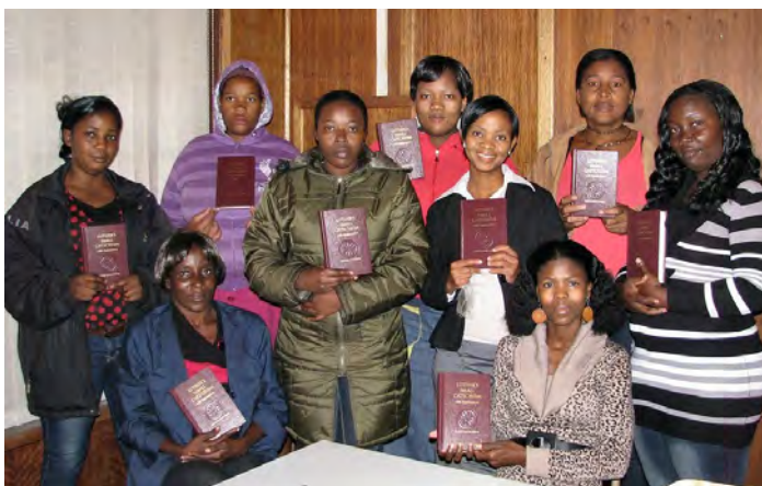
Deaconess students show Small Catechisms donated by St. John—Grace Women's Guild of South Holland, IL