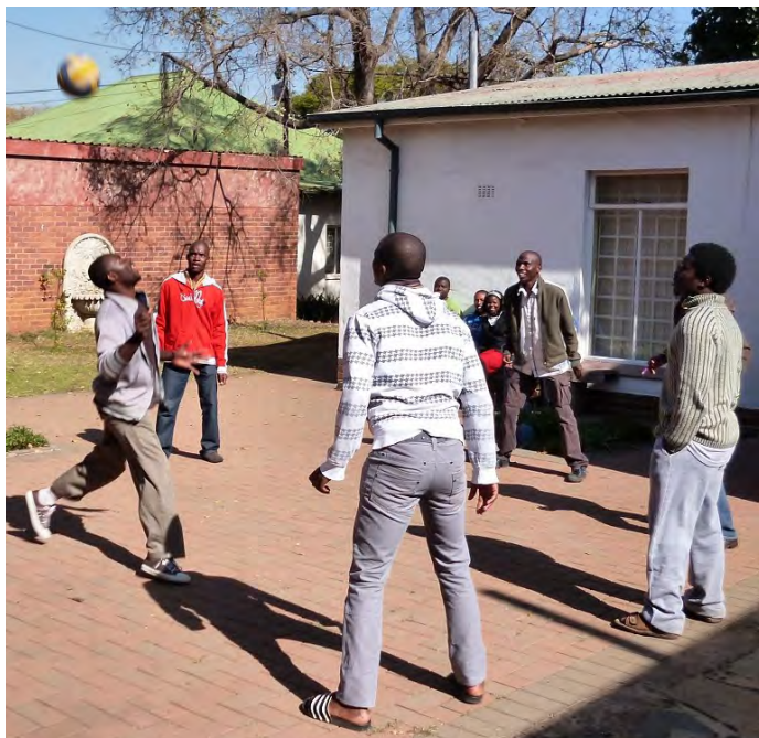
LTS students taking a break "heading" a soccer ball after using their heads for a final exam