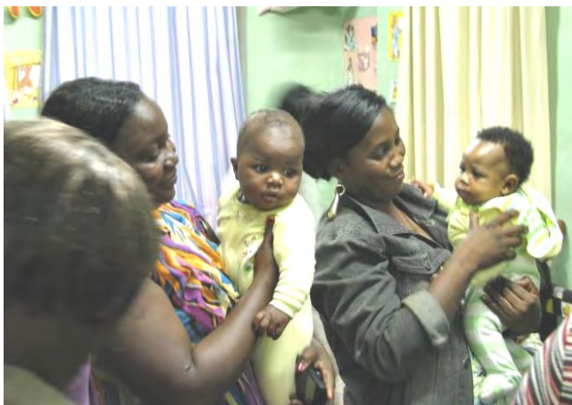
Deaconess students hold babies while touring a crèche in inner city Pretoria