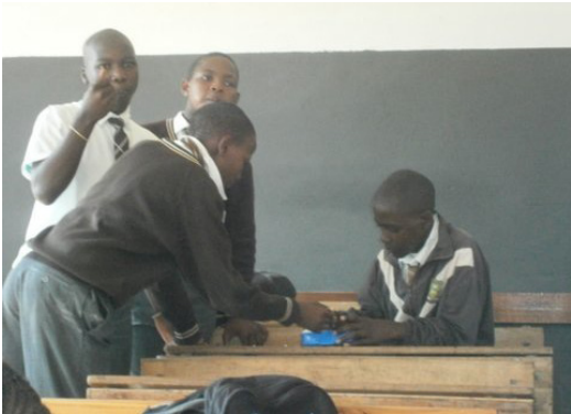
Four Students Sharing a Tupperware Bowl