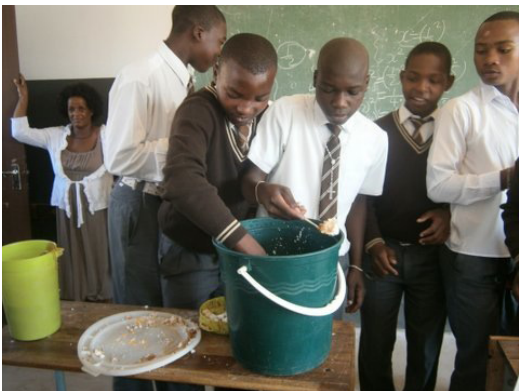
Sharing a Bucket to Eat From