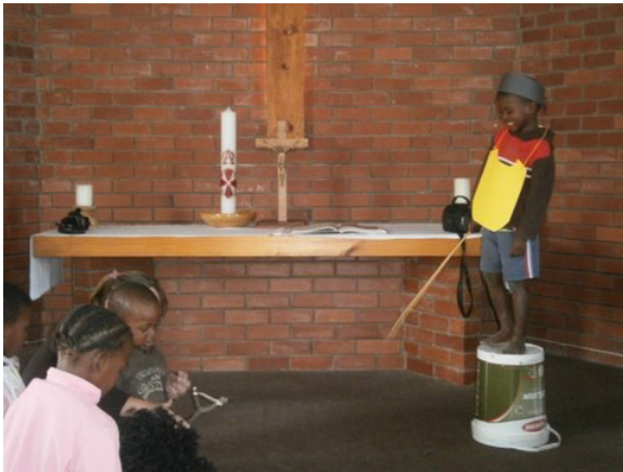
Acting out David and Goliath