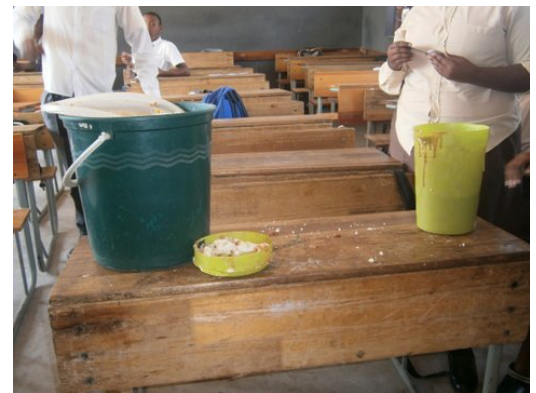
Using a Pitcher and Its Lid for Plates