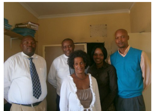
Some of the Staff